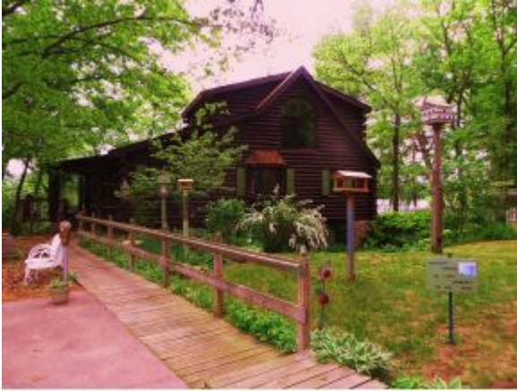
Long Home - Rainbow Lake