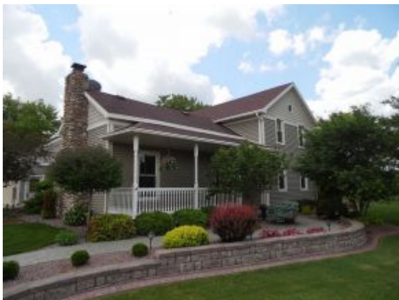
Incredible, Updated Head to Toe