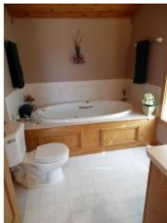
Whirlpool in Upper Master BA