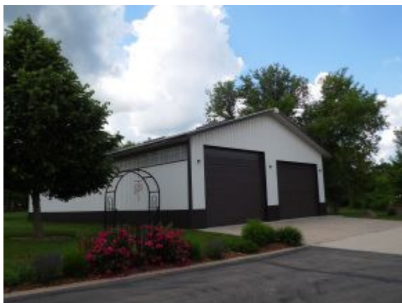
42 ft x 80 ft w/13 ft Door