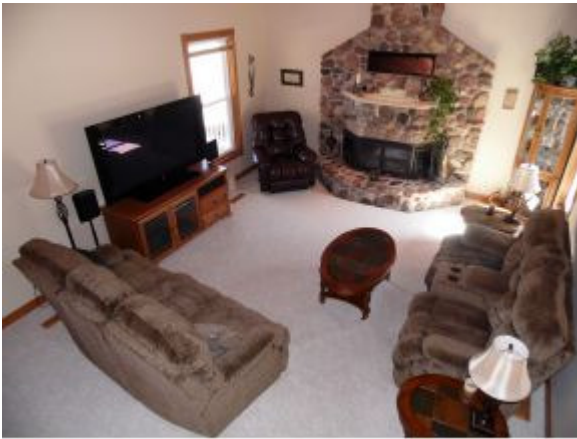
Great Rm w/Wood Burn FP