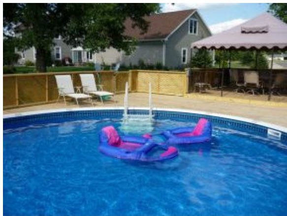
Private Fenced in Pool & Deck