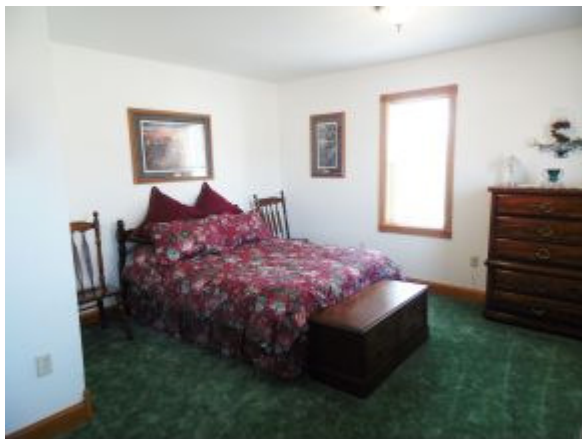
1st Flr Master Bd w/Bath Attd