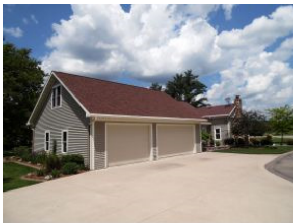
Convenient Attached Garage