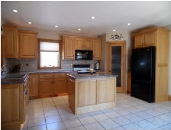
Updated Cooks Delight Kitchen