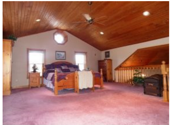
Spacious Master Suite