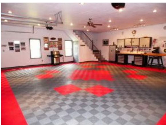
Large 3+ Car Att Gar w/Loft