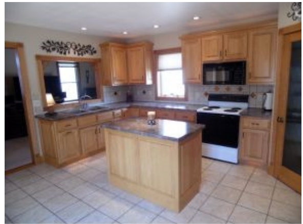
Lrg Center Island & W/I Pantry