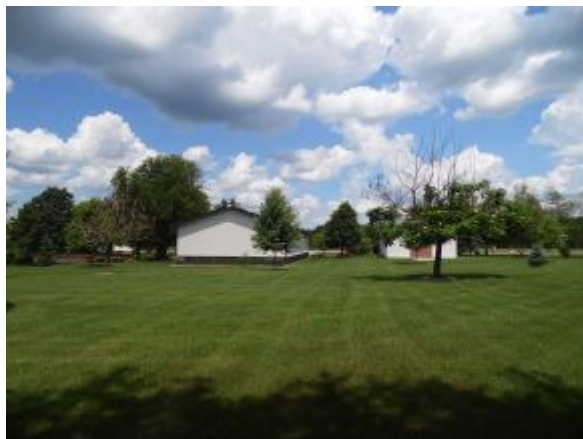
Sprawling Lot w/Mature Trees