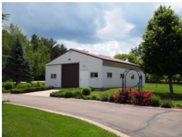
30 ft x 40 ft Pole Shed