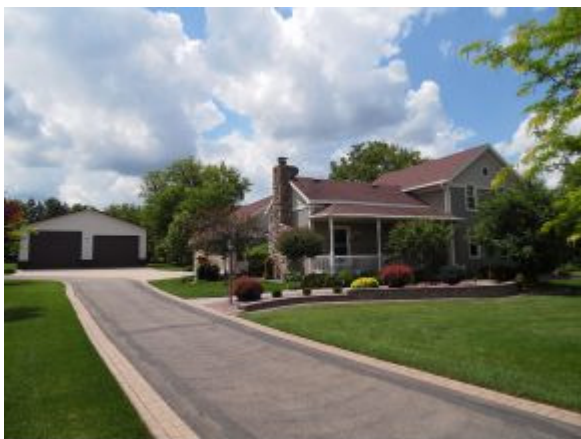
Brick Paver Lined Driveway