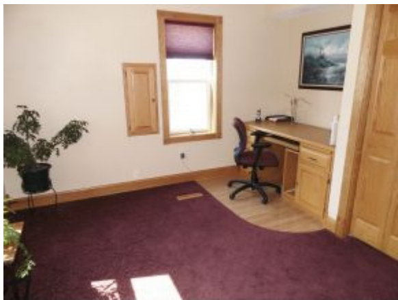
3rd Bedroom/Office or Den