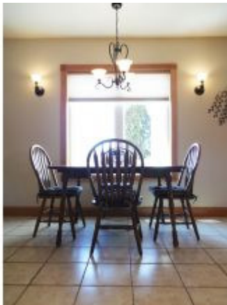
Sun-Filled Dining Area