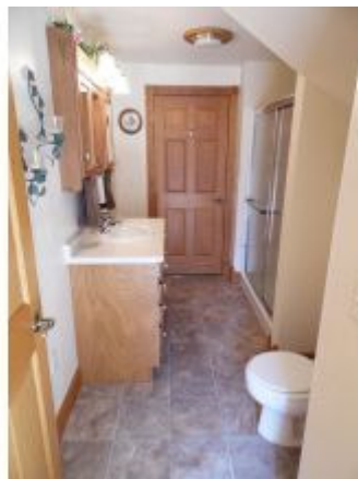
Full Main Floor Bathroom