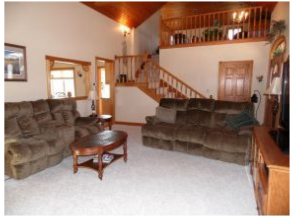
Master Suite Overlooks Grt Rm