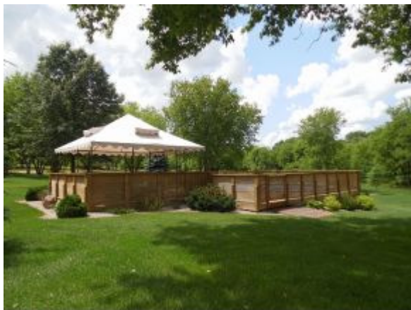
Peaceful Deck Area