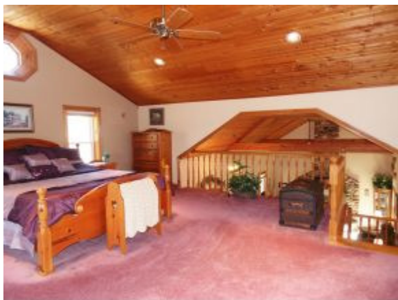
Master Overlooks Great Room