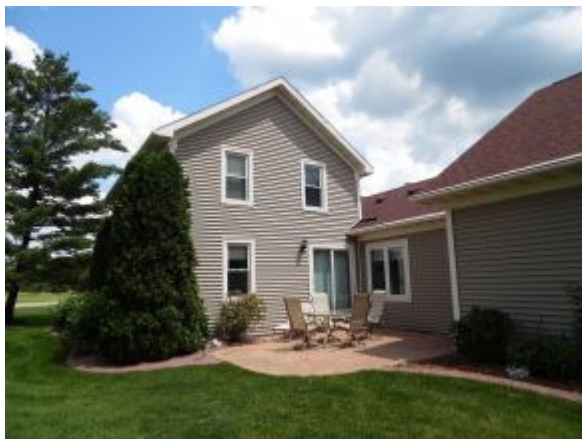
Priv Patio Overlooks Lrg Lot