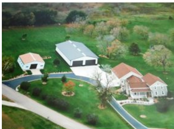
Sprawling 5.216 Acre Lot!