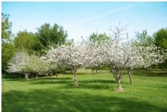
Beautiul Private Orchard