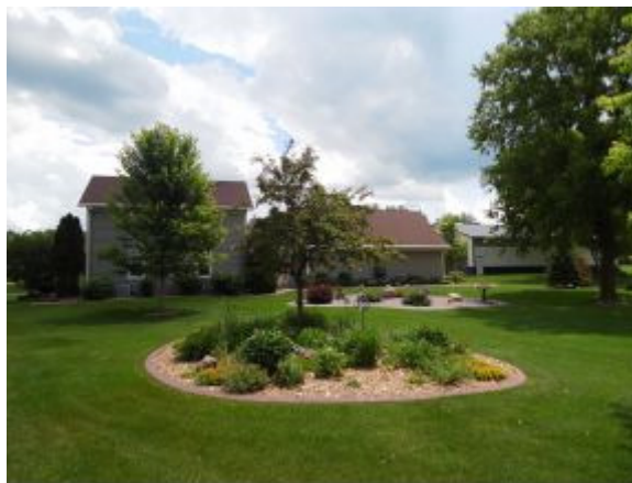
Incredible Lush Landscape