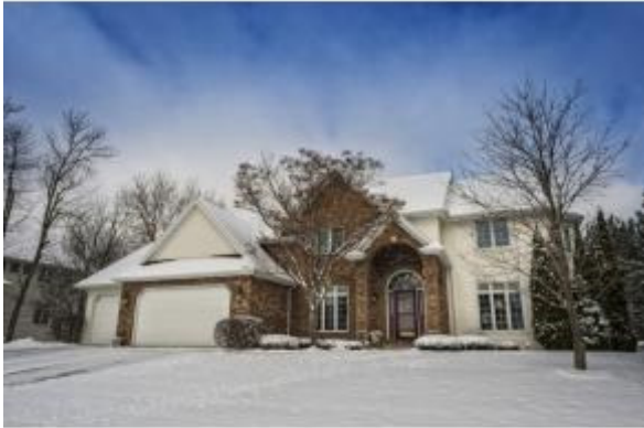
Gallery: Images 1 to 6 of 25